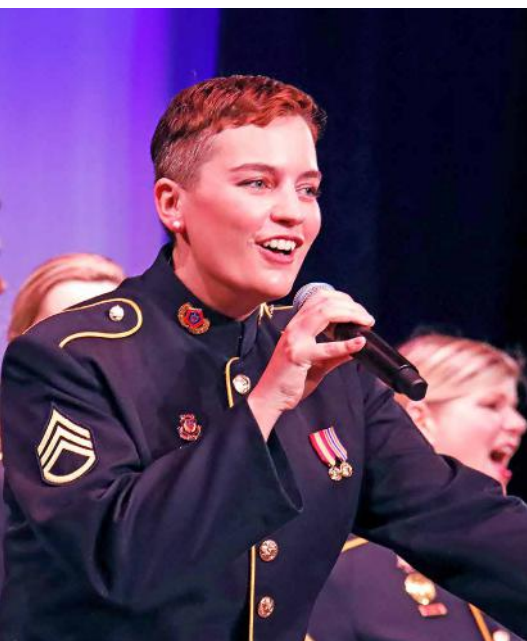
Soldiers' Chorus, March 2023.