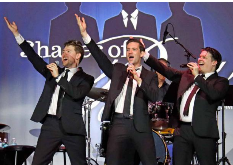
Shades of Bublé onstage at the CAC.