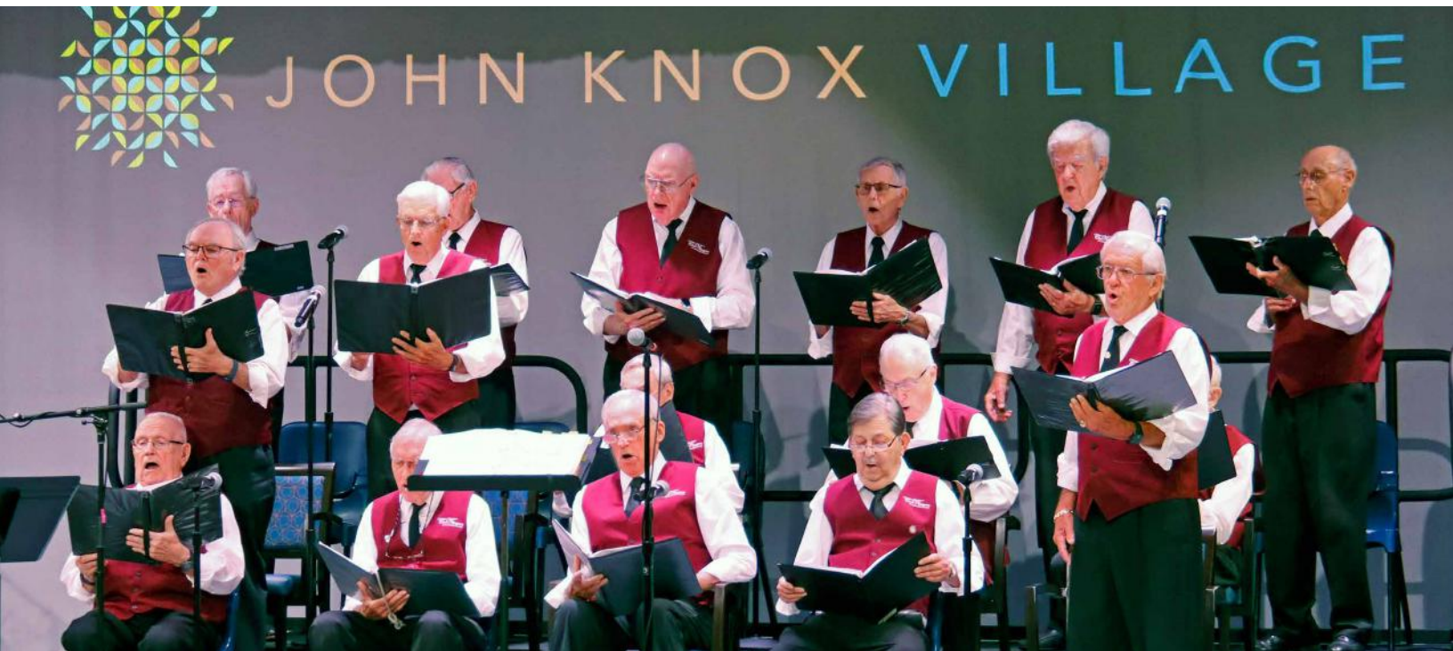
On stage at JKV's Cultural Arts Center are members of The Villagers, JKV's male chorus which has been an institution on the Village campus, having been formed in 2006.

Village Choruses Triumphantly Return to the Stage