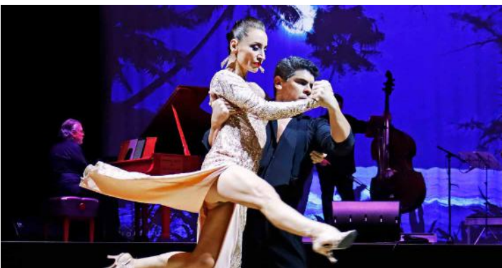
Milonga Under the Stars. Page 10.