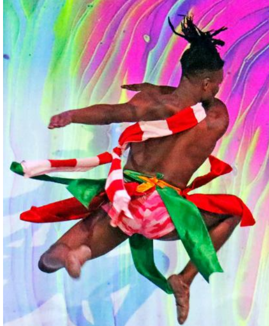
Ashanti Cultural Arts performing the "Chocolate Nutcracker," December 2022.