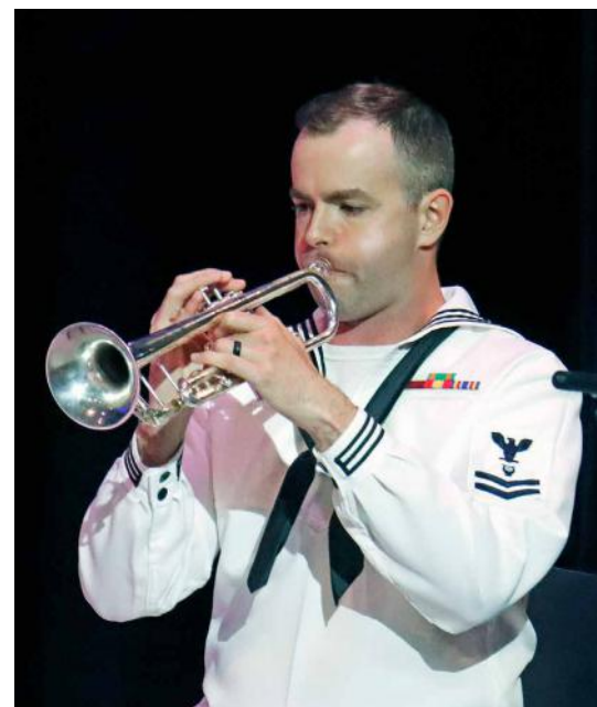
Navy Band Southeast, April 2023.