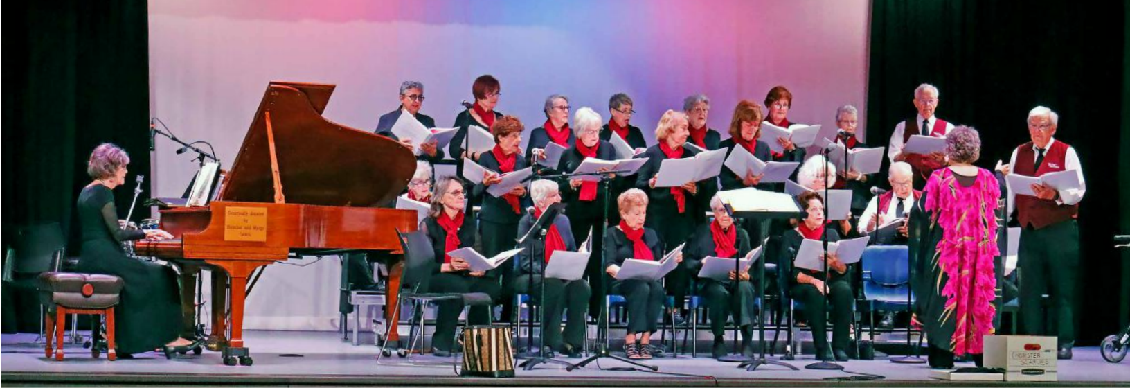
The Choristers take center stage at the Cultural Arts Center.