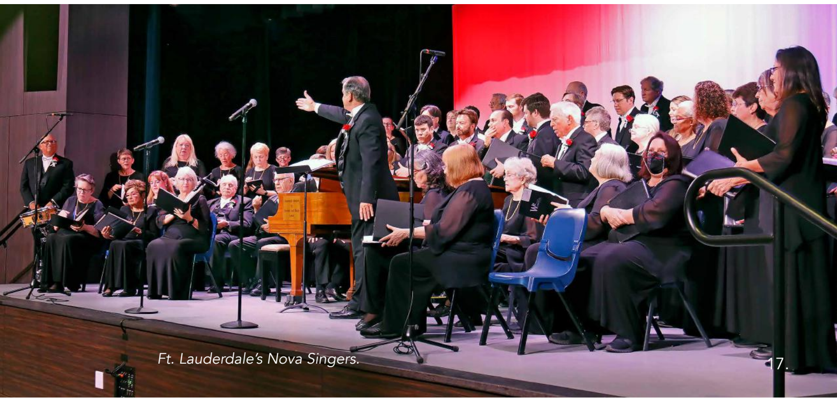
Ft. Lauderdale's Nova Singers.