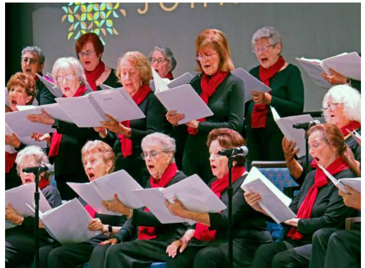
Members of the Choristers.

Both The Villagers and Noteables featured an enthusiastic group of singers, who performed to appreciative audiences throughout the JKV campus, as well as concerts throughout Broward County.