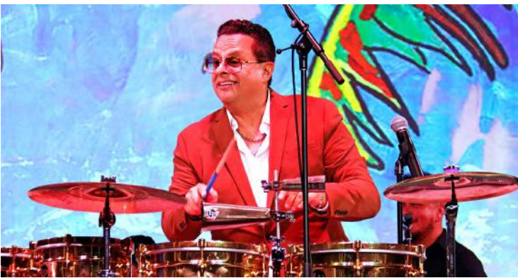
Tito Puente, Jr. Page 8.