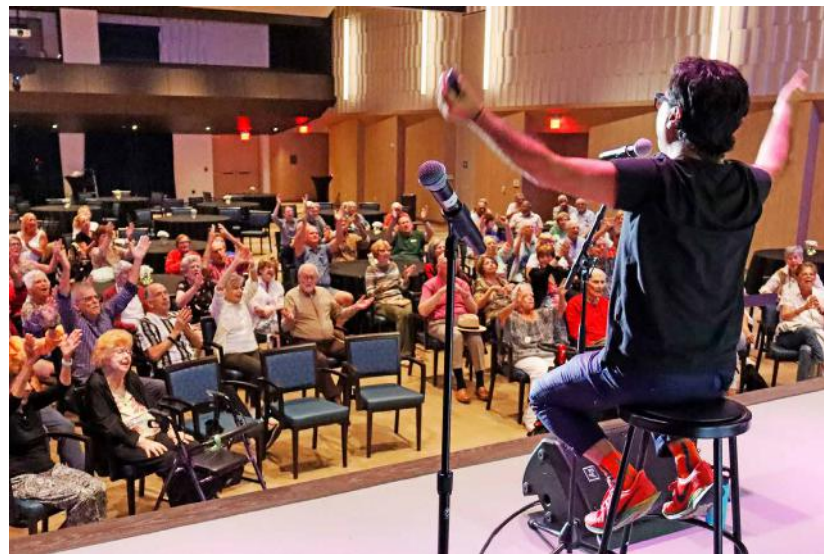
The Karaoke singalong of Choir...Choir...Choir!