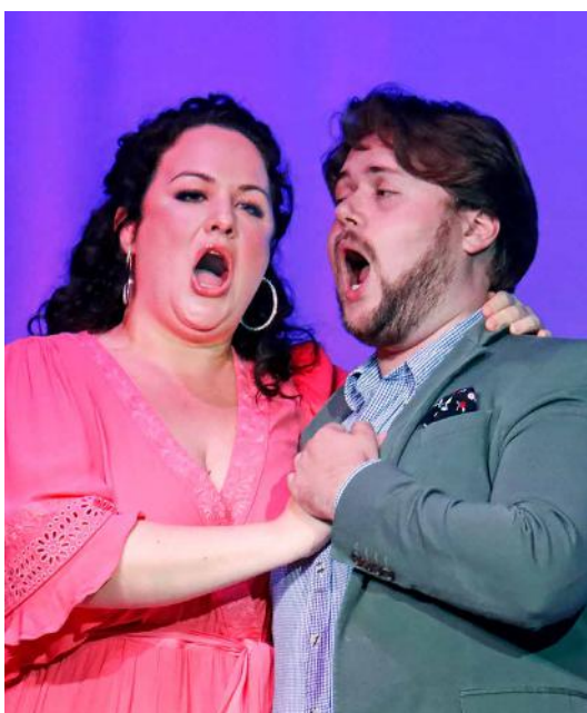
Florida Grand Opera Studio Artists, April 2023.