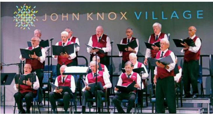
JKV Villagers and Choristers return to stage. Page 6.