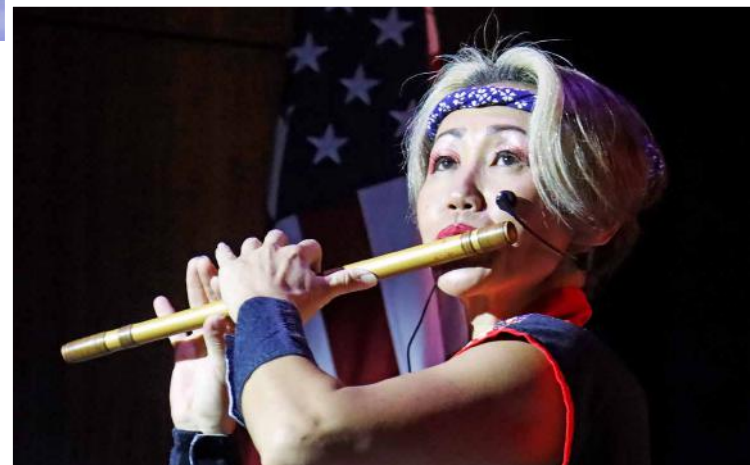
The rhythm of the drums was accented by the tones of the Fue (Japanese flute).

When performing at JKV, residents reported experiencing emotional releases and being moved to tears by the taiko performance. The joyful celebratory nature of taiko drumming helps to lift the spirits of those who are in the presence of the spectacle and vibrations. Ancient Japanese culture has brought forth the spirit of taiko that Fushu Daiko proudly represents.