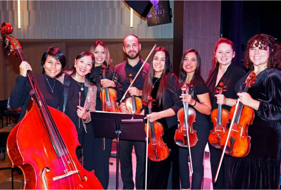
The Village Arts Circle helps to support performances and programs including the South Florida Symphony Orchestra.