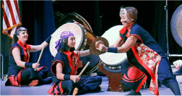
Fushu Daiko: Japanese Drumming. Page 4.