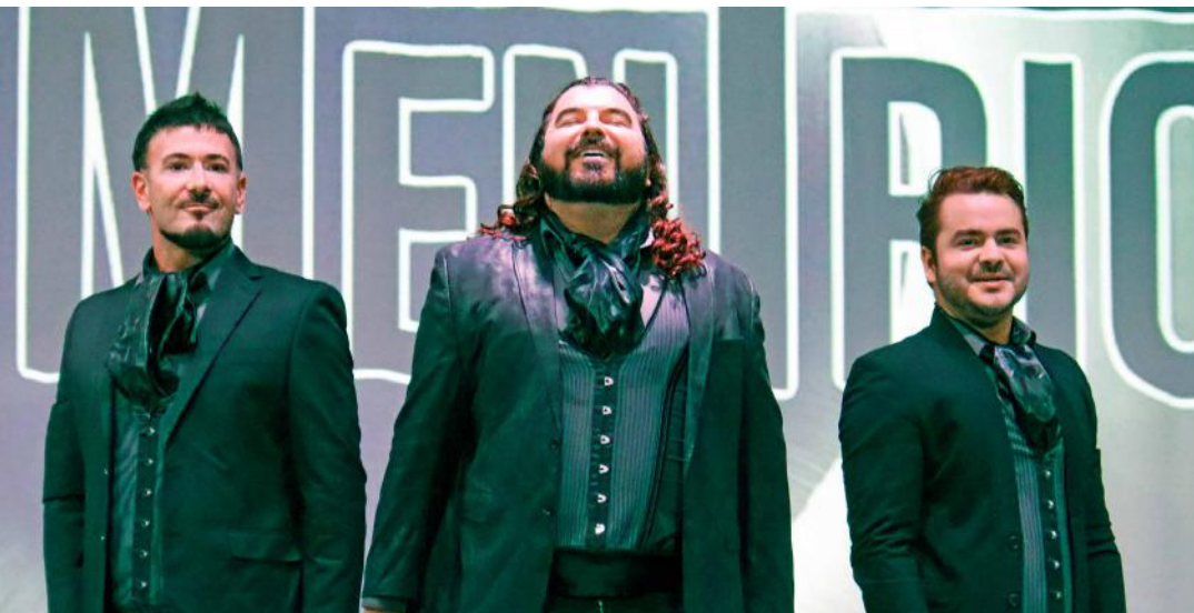
EleMenTrio, May 2023.