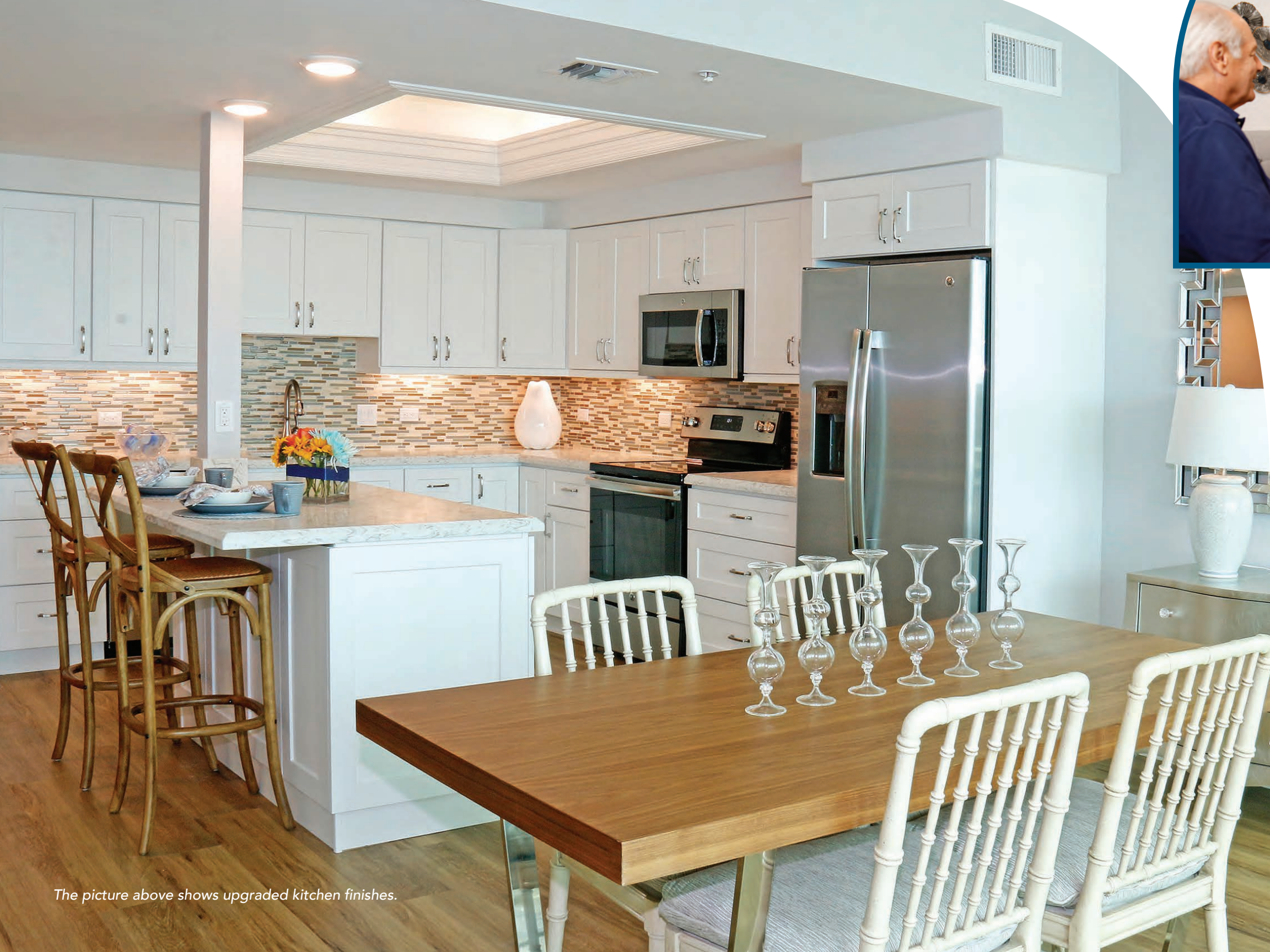
The picture above shows upgraded kitchen finishes.